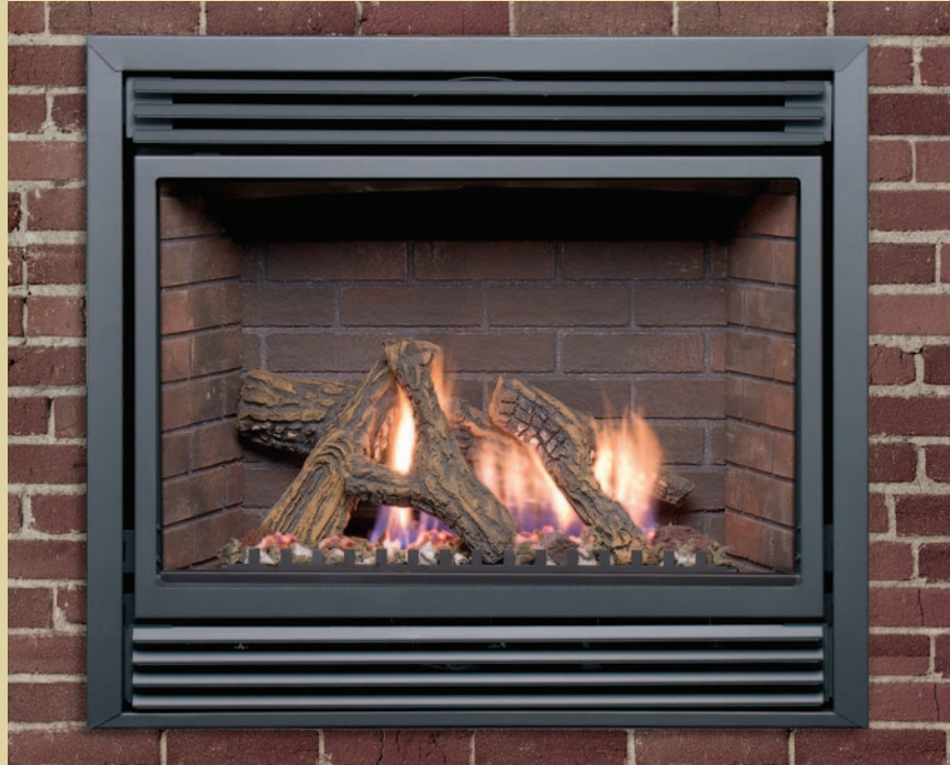
MB-36 with Louvres