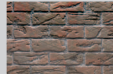
Traditional brick pattern shown here in Old Town Red

Two brickset patterns are available in both Old Town Red and Boston Buff.