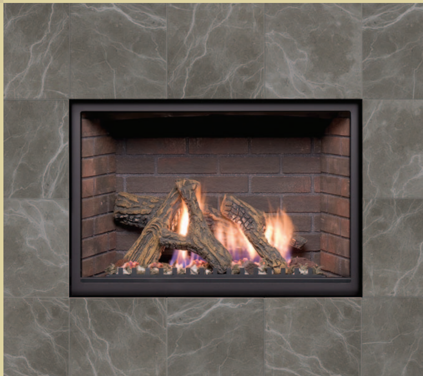
MB-36 Clean Face